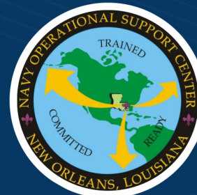
NOSC New Orleans

NAS JRB New Orleans is a constant center of activity for air operations, ground operations, and a variety of family support services. From major military construction projects to the replacement of the smallest segment of sidewalk, NAS JRB New Orleans consistently and aggressively implements improvements to operations support, quality of life, and the safety of personnel.