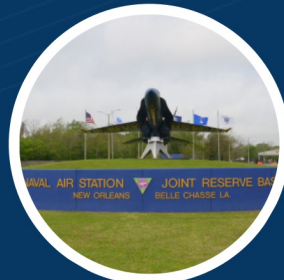
Naval Air Station Joint Reserve Base New Orleans

NAS JRB New Orleans is a constant center of activity for air operations, ground operations, and a variety of family support services. From major military construction projects to the replacement of the smallest segment of sidewalk, NAS JRB New Orleans consistently and aggressively implements improvements to operations support, quality of life, and the safety of personnel.